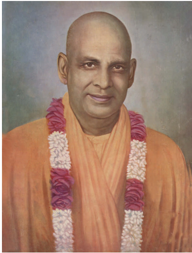
Gurudev Swami Sivananda